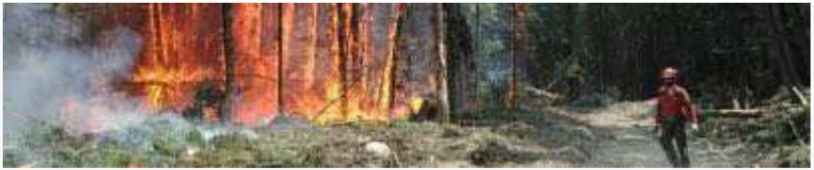
Photo Tours for CAPA Members

For members in the Lower Mainland, did you know that regular outings are organized just for you? Recent trips have included the Harry Jerome Classic, Surrey Public Library, Stanley Park and more. The next outing is to Bowen Island on Saturday, August 12.