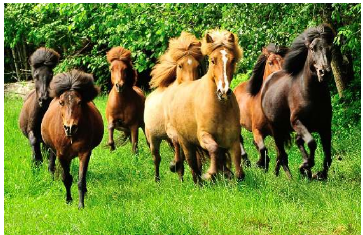
Photo: Icelandic Horses at Toltaway Icelandic Horse Farm—Weekend Away at Enderby 2013.

FIELD TRIP to Merritt area to photograph Icelandic Horses. Angelina showed a photo at SHOWCASE of a darling one-day old foal. These small sturdy horses are extremely photogenic. Angelina is setting up the outing.